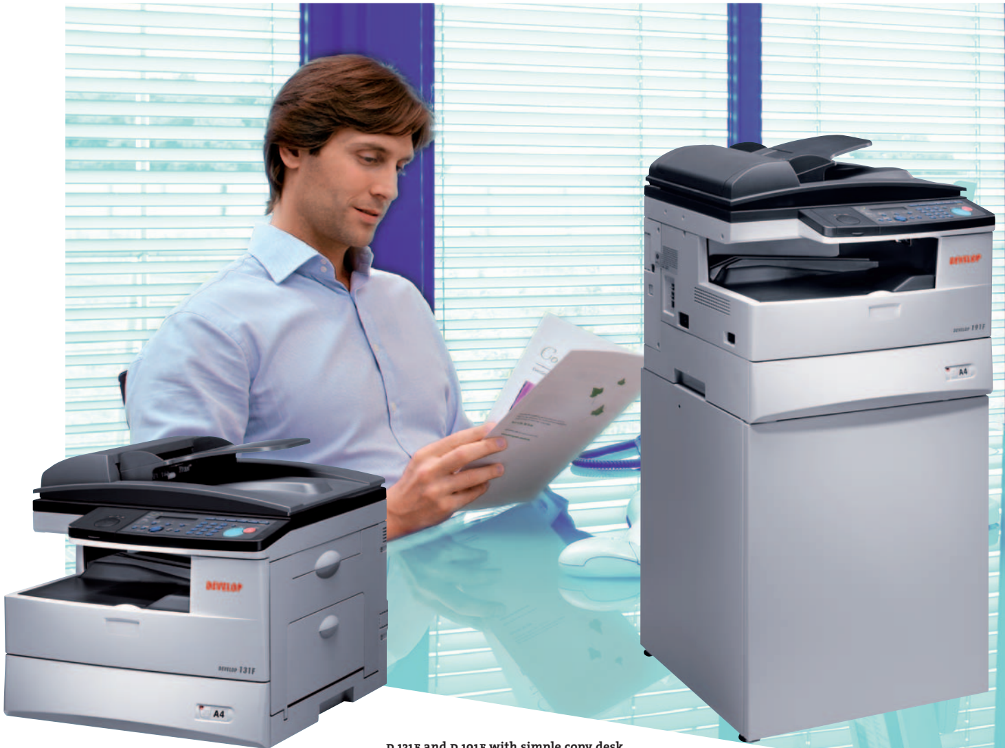
D 131F and D 191F with simple copy desk. However you use this talented all-rounder – right at a workplace or as a communication hub – you're sure of a rapid return on investment.